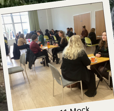
Year 11 Mock Interviews