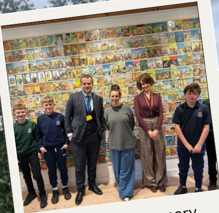
Stapleford Granary Visit