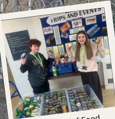
Comic Relief Food