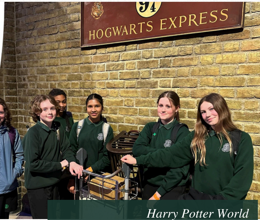
Harry Potter World

A feature of our school is the range of opportunities we offer our students outside of the curriculum: trips, visits, clubs and experiences. Here's a brief snapshot of the events which have taken place this academic year so far.