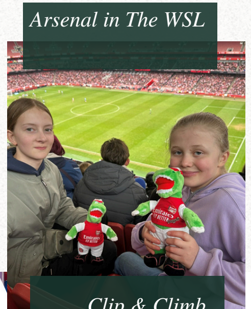
Arsenal in The WSL